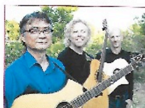
California Guitar Trio Performing Arts Center Tuesday, November 20, 2018 • 7:30 p.m.