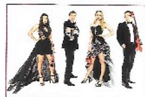
DSQ Electric Performing Arts Center Tuesday, November 6, 2018 • 7:30 p.m.