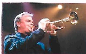
Danzel Fire Performing Arts Center Thursday, April 5, 2019 • 7:30 p.m.