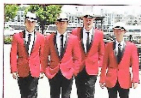
The Jersey Tenors Performing Arts Center Thursday, October 4, 2018 • 7:30 p.m.