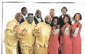
Masters of Soul Performing Arts Center Thursday, May 2, 2019 • 7:30 p.m.