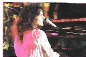
Tapestry: The Carole King Songbook Performing Arts Center Friday, February 15, 2019 • 7:30 p.m.